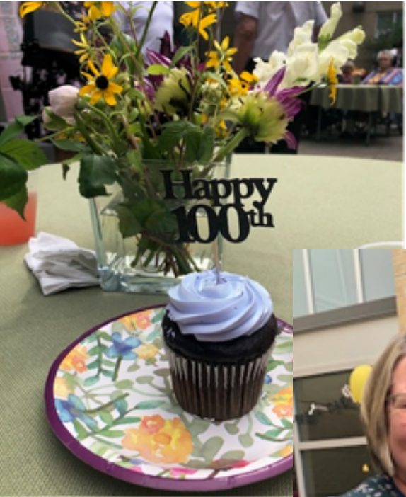
Congratulations on your 100th Birthday!