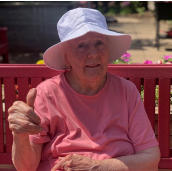
Enjoying outdoor fun!