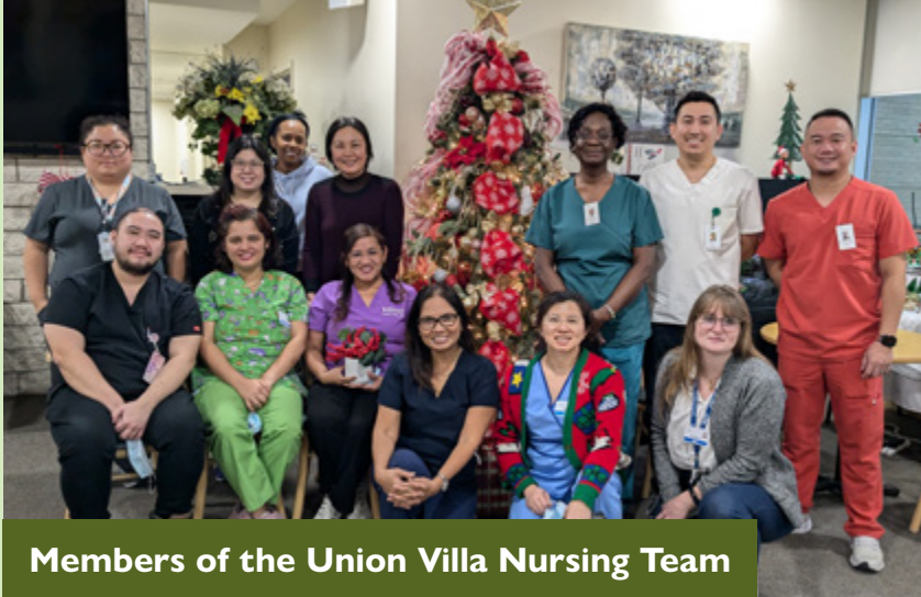
Members of the Union Villa Nursing Team

We wish you Happy Holidays and all the best for the New Year!