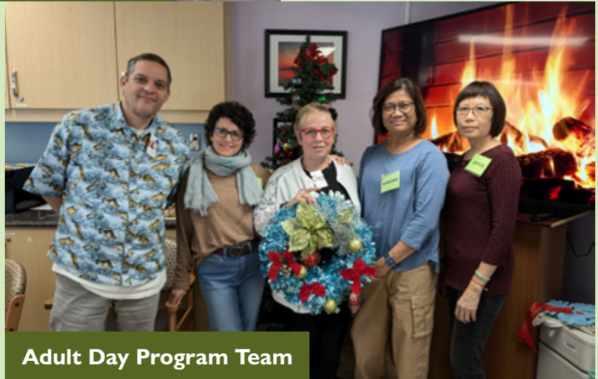
Adult Day Program Team