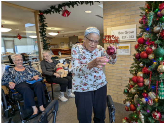
Deck the Union Villa halls with balls and holly!