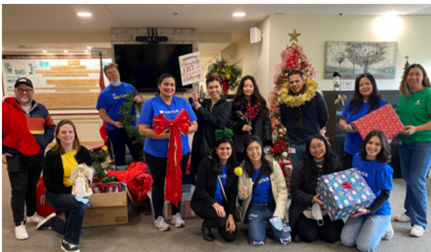
Volunteers from AVIVA kick off holiday decorating at Union Villa