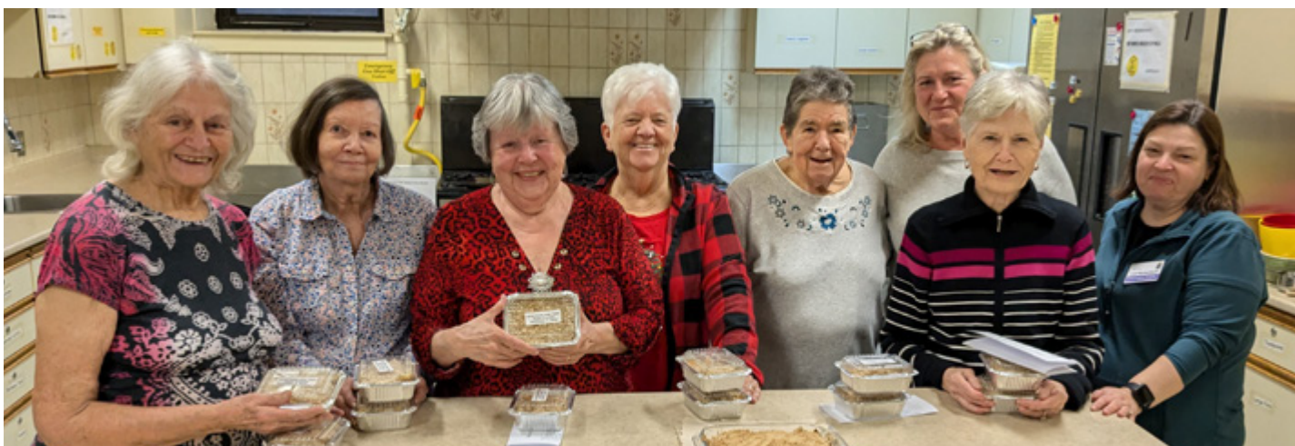
Holiday baking with UCCS members