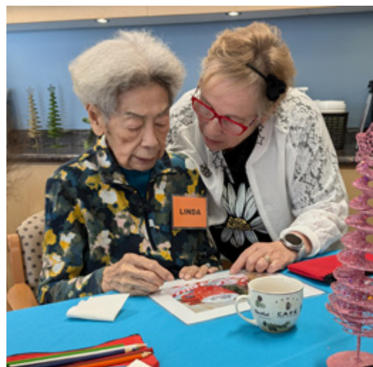
ADP clients enjoy holiday crafting