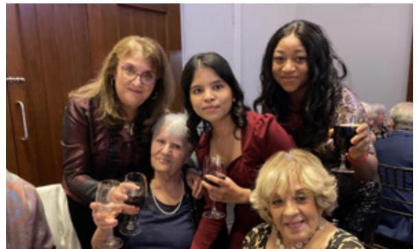
Union Villa Residents with staff