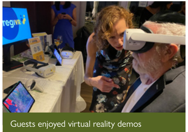
Guests enjoyed virtual reality demos