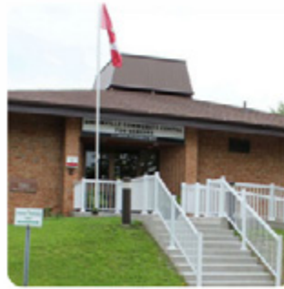
Unionville Community Centre for Seniors