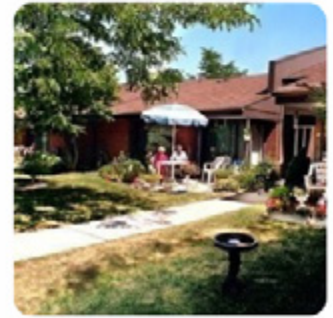
Heritage Village Bungalows