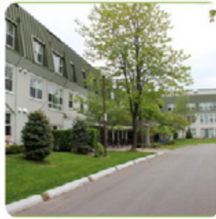
Wyndham Gardens Apartments