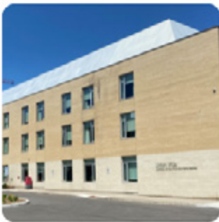
Union Villa Long-Term Care