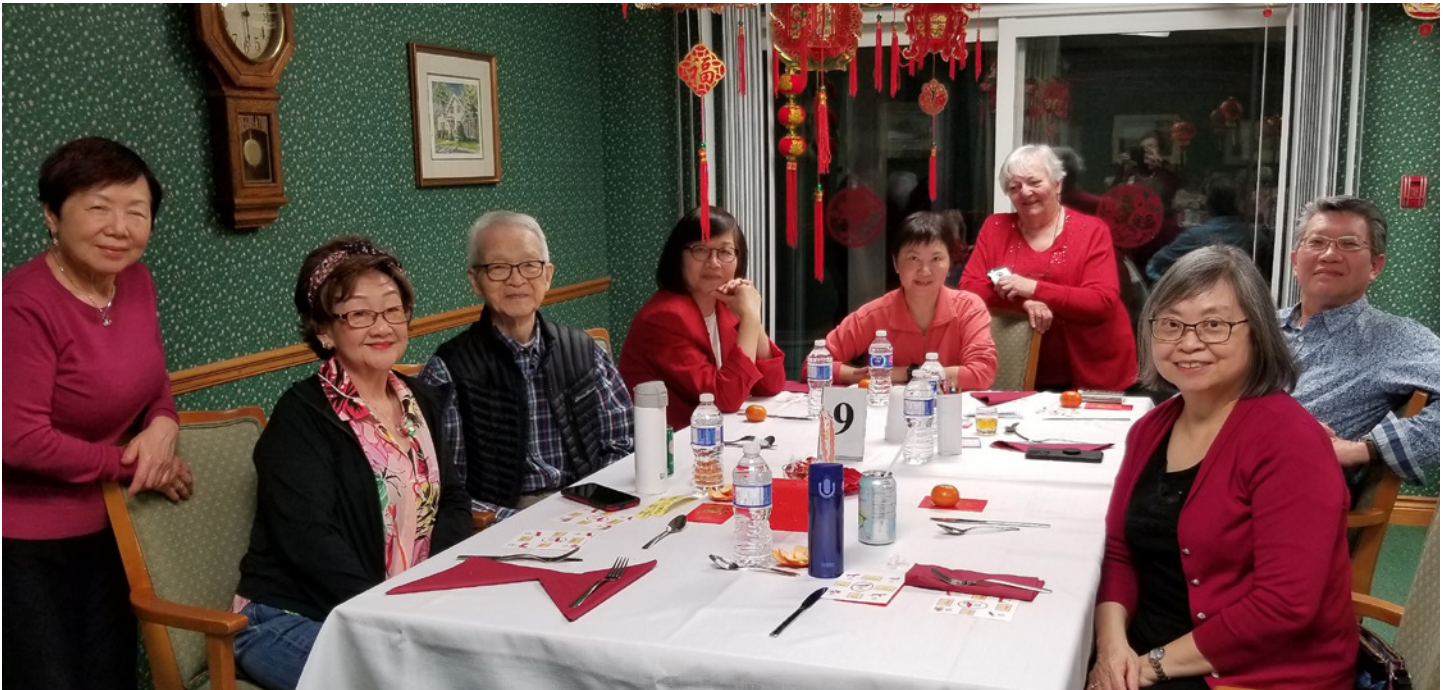
Wyndham Gardens residents enjoy a Lunar New Year Celebration evening