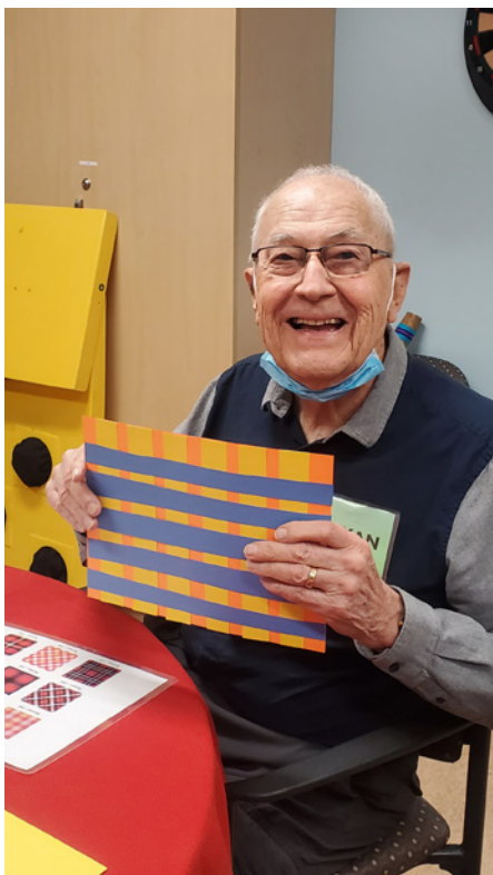
ADP presents a Scottish Appreciation Day