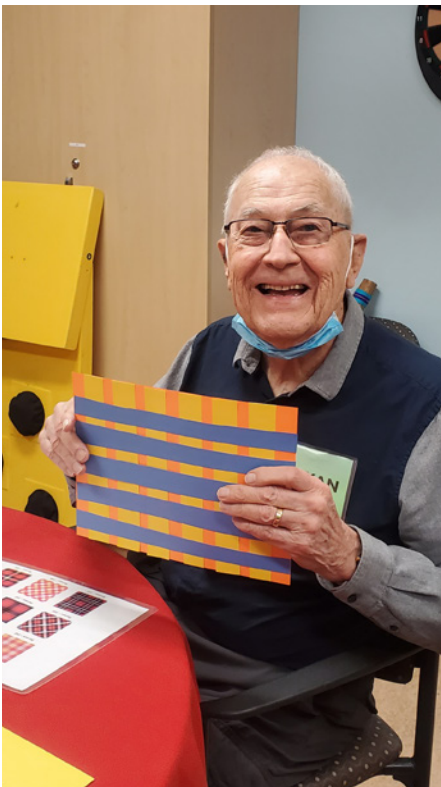
ADP presents a Scottish Appreciation Day