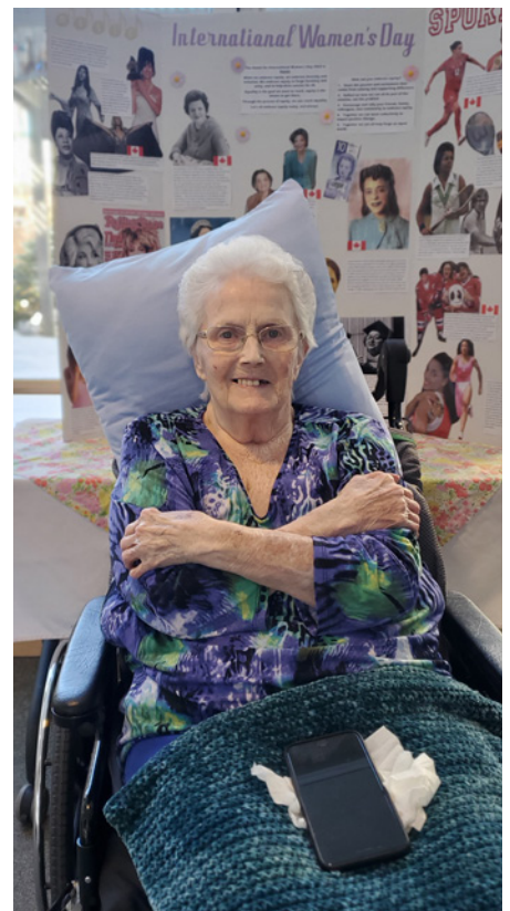
Embracing Equality - IWD 2023