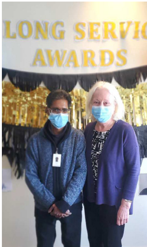
Employee Service Awards Presentation