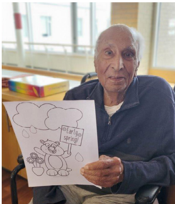
Groundhog Day - Resident predictions