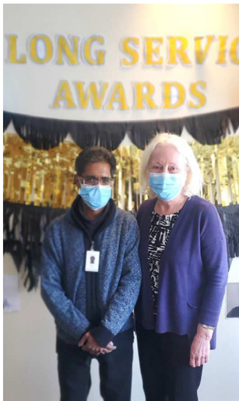
Employee Service Awards Presentation