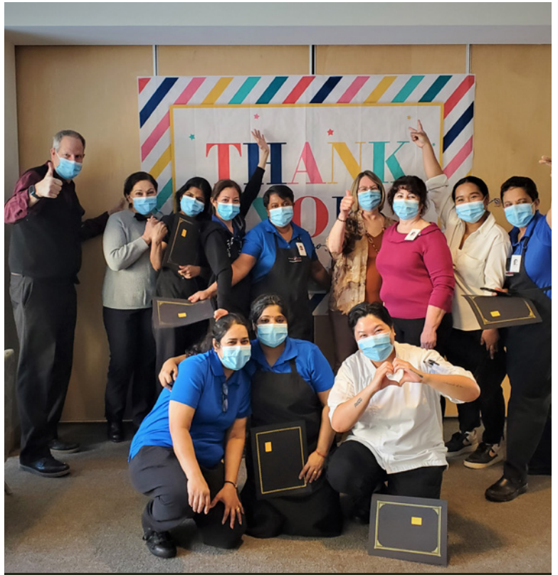
Union Villa recognizes the Dietary Team