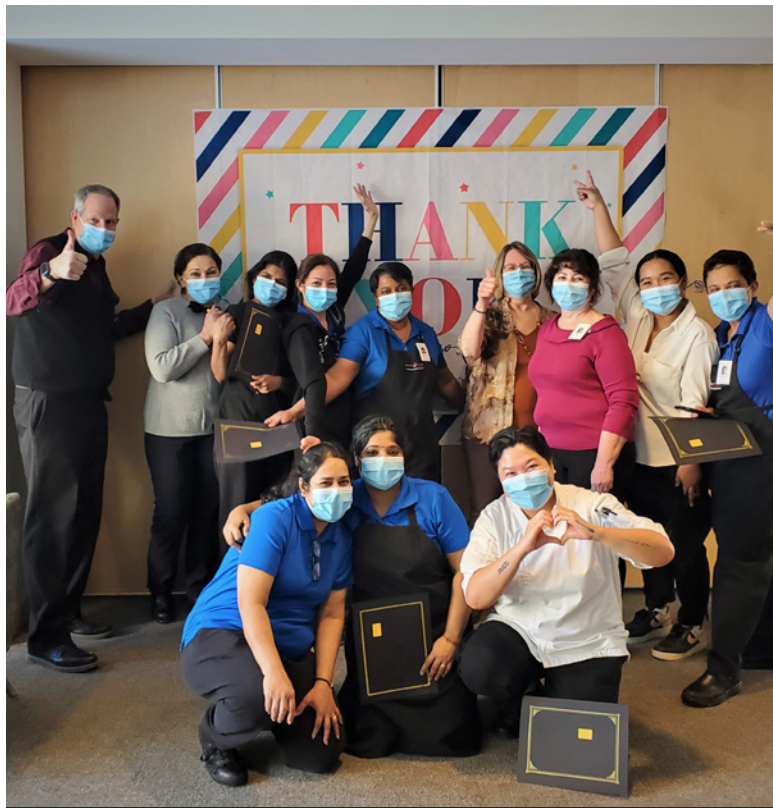
Union Villa recognizes the Dietary Team