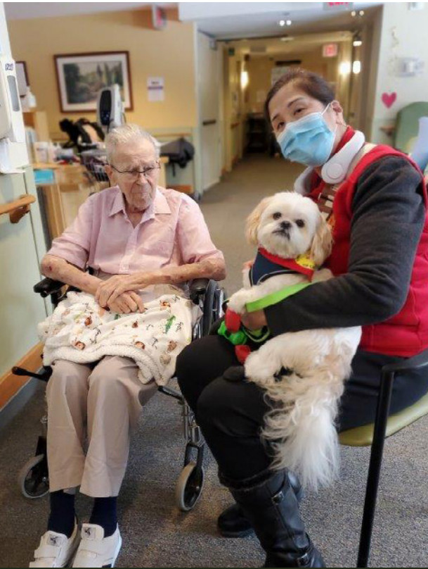
Therapeutic Paws at Union Villa