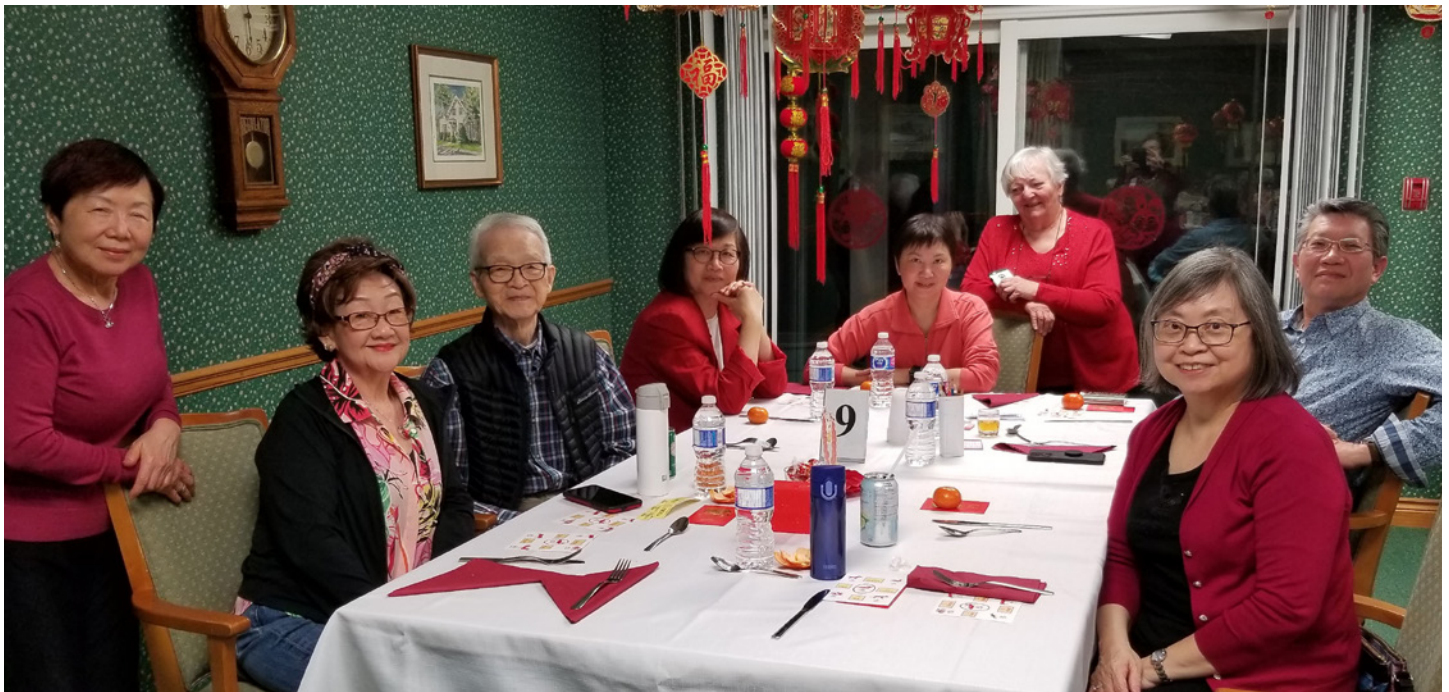
Wyndham Gardens residents enjoy a Lunar New Year Celebration evening