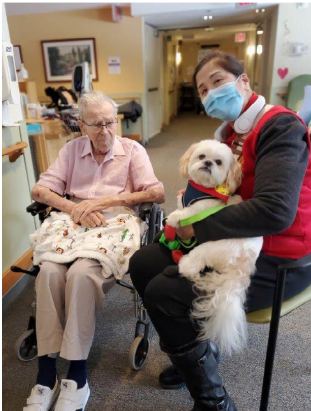
Therapeutic Paws at Union Villa