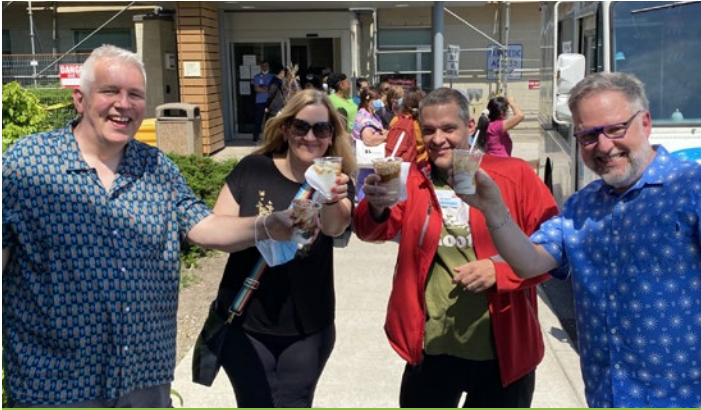
Appreciating our staff with ice cream (compliments of The Paul Butler and Chris Black Foundation at the Toronto Foundation)