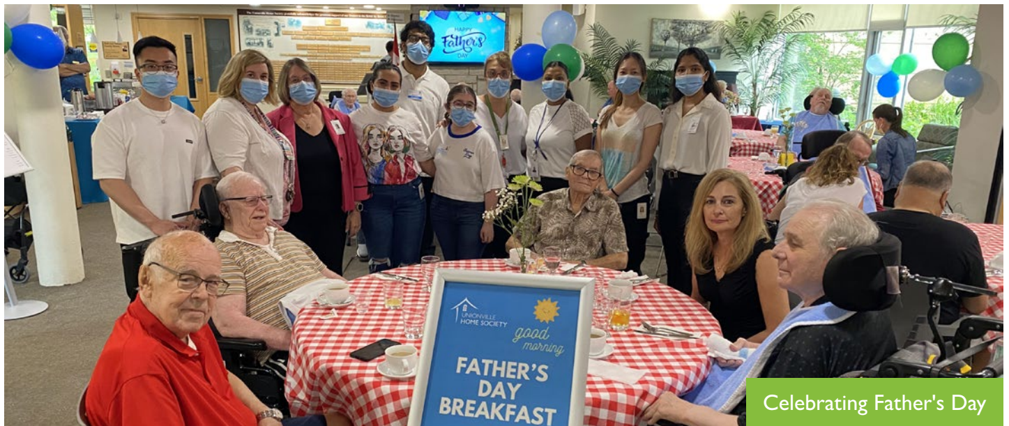
Celebrating Father's Day