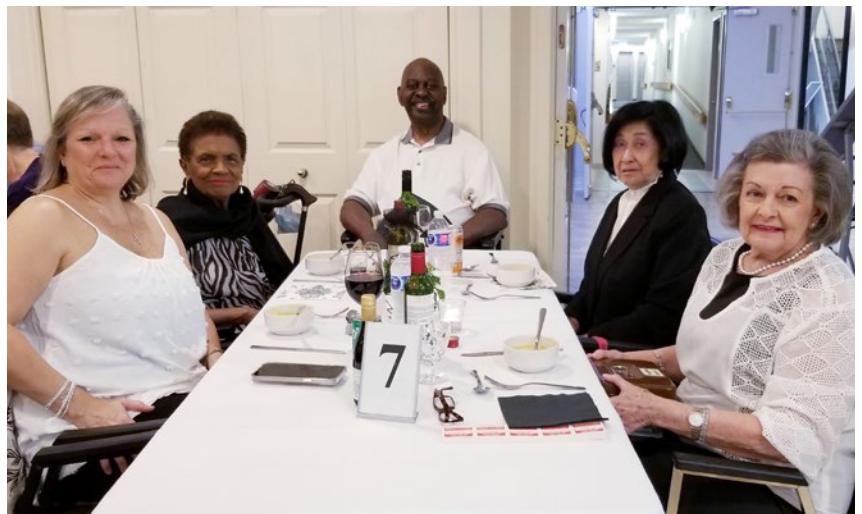
Wyndham Gardens presents a Black & White Dinner Party