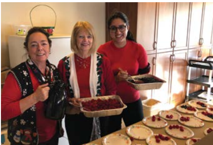
Prepping for the Seniors' Holiday Luncheon